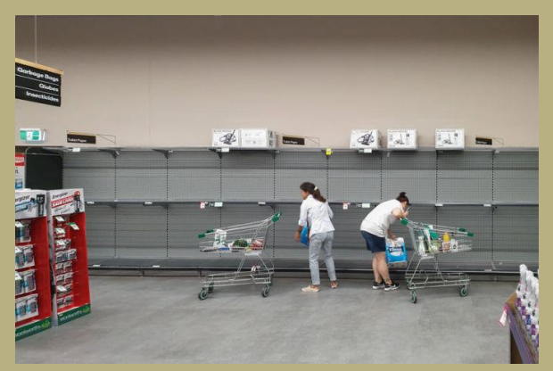
Gold Coast, Australia - Empty toilet paper shelves as shoppers start stockpiling, yet again.

What's it about Aussies and toilet paper? "Stop it, it's ridiculous!" Prime Minister Scott Morrison told fellow Aussies on Friday. "Stop it! it's ridiculous," Prime Minister Scott Morrison told fellow Aussies (who are, yet again, panic buying toilet paper) on Friday. Across Australia, supermarkets are running out and imposing quotas.