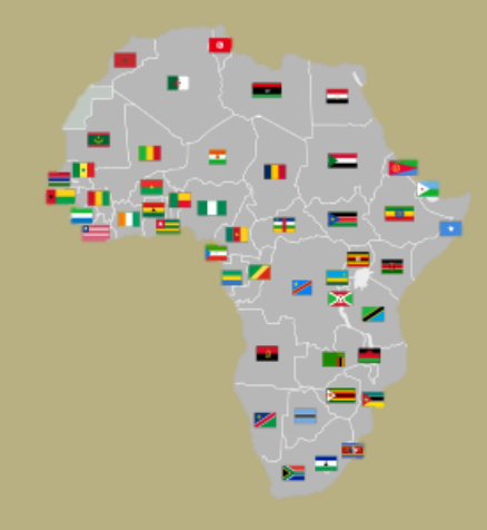
Friday 26th June 2020