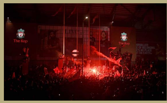
Fans celebrating last night

"It is an incredible achievement from my players... and a pure joy for me to coach them."