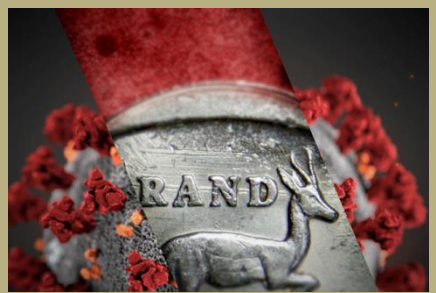
Here's what is happening in and affecting South Africa today:

Coronavirus: Total global infections since the start of the year have hit 9.4 million, with the death toll now over 482,000. In South Africa, cases continue to climb, with the country registering 6,579 new cases taking the total to 118,375. Deaths are also increasing, with the toll now at 2,292. Recoveries are at 59,974, leaving a balance of 56,109 active cases.