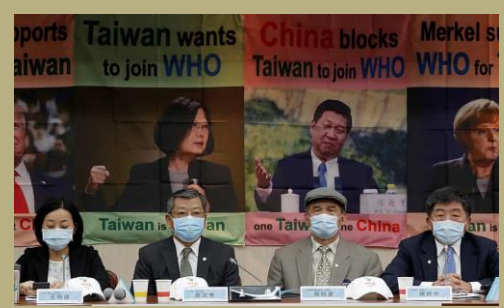
Taiwan's health minister holds a press conference on its bid to become a member of the World Health Organization.

Beijing faces pressure over Taiwan's status and an investigation into the origins of Covid-19. Plus, how the lockdown could leave us with cleaner, greener cities.