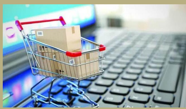
CAPE TOWN – Following the government's move to lift restrictions on eCommerce, allowing e-tailers to sell everything except alcohol and cigarettes, South Africans are no longer limited in terms of the products that they would like to buy online, with immediate effect.

E-tailer Loot.co.za, along with several other eCommerce platforms, had called for the government to widen the definition of essential goods and services, driven by the spike in demand for online shopping since the start of the lockdown.