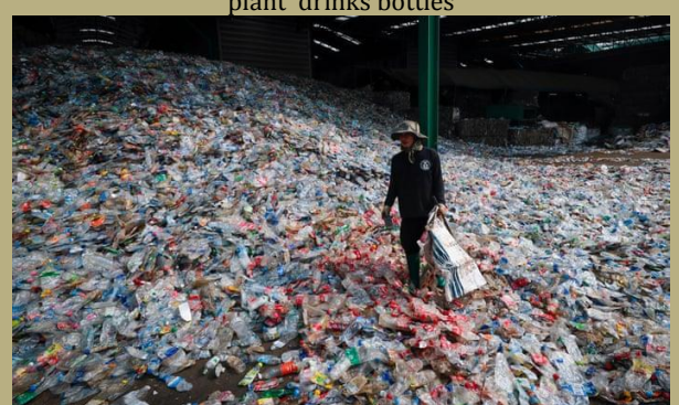
A mound of plastic bottles at a recycling plant near Bangkok in Thailand. Around 300 million tonnes of plastic is made every year and most of it is not recycled.

Carlsberg and Coca-Cola back pioneering project to make 'allplant' drinks bottles