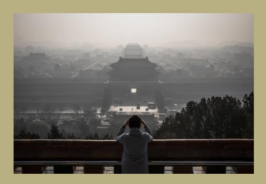
By Kate Abnett Daily Maverick

BRUSSELS, May 18 - China's levels of some air pollutants have risen back to above last year's levels after dropping when the government imposed strict lockdown measures to contain the coronavirus pandemic, according to a study published on Monday.