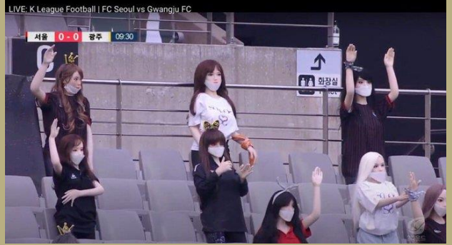
South Korean football club FC Seoul has apologised after using sex dolls to fill up its empty stands during a game at the weekend.

K-League club FC Seoul said the dolls, used to make stadiums look less empty, had been ordered inadvertently after a 'misunderstanding'