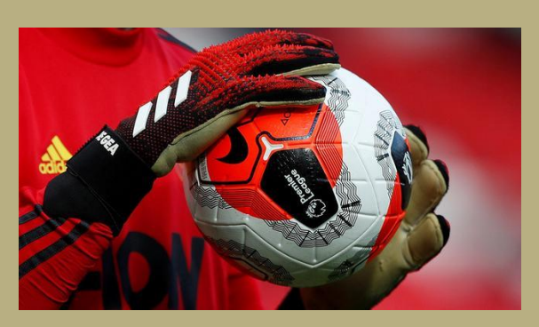
By Sports Reporter

The Premier League shareholders have voted unanimously to return to small-group training from Tuesday afternoon. It has been over two months since the league was stopped due to the coronavirus pandemic.