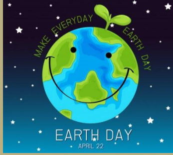
By Earth Day Network

Earth Day is an annual event celebrated around the world on April 22 to demonstrate support for environmental protection. First celebrated in 1970, it now includes events coordinated globally by the Earth Day Network in more than 193 countries.