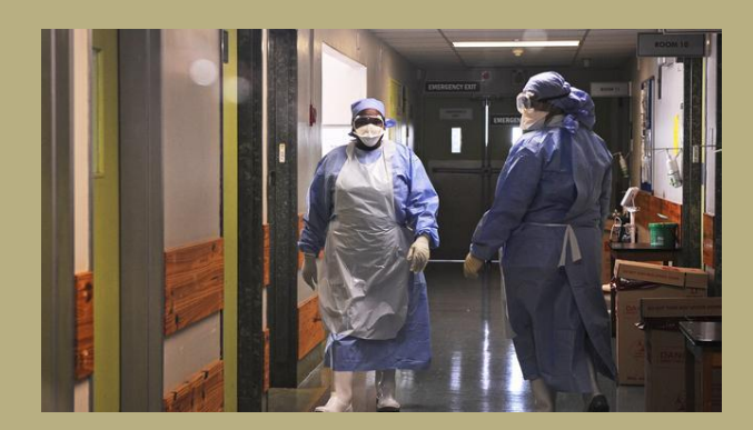
Cape Town - The Western Cape has now officially recorded over 1 000 Covid-19 infections since the first case was detected on March 11.

The Western Cape also recorded five new deaths, which include three men, aged 43, 49 and 79 and two women, aged 54 and 95, respectively.