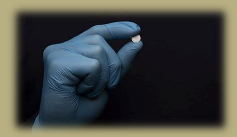
The controversial malaria drug hydroxychloroquine, which Trump had pushed - without evidence - as a possible treatment for the coronavirus.

Vaccine expert Rick Bright claims he was fired after resisting the president's push for an unproven Covid-19 treatment.