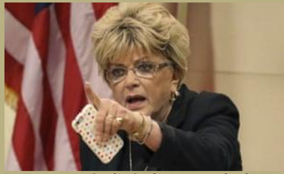
Las Vegas mayor Carolyn Goodman attracted widespread criticism for saying she wants the city's businesses to quickly reopen.

Carolyn Goodman, the independent mayor of <u>Las Vegas</u>, has said she wants the city's casinos, hotels and stadiums to quickly reopen in an interview that attracted widespread criticism.