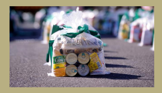
Cape Town - The nationwide lockdown has put economic pressure on households and families across the country.

With many not able to work and earn a salary right now, the need for humanitarian and food relief is urgent. Over the weekend, Premier Alan Winde was part of the President's Coordinating Council where the need for food relief was discussed as a matter of deep concern.