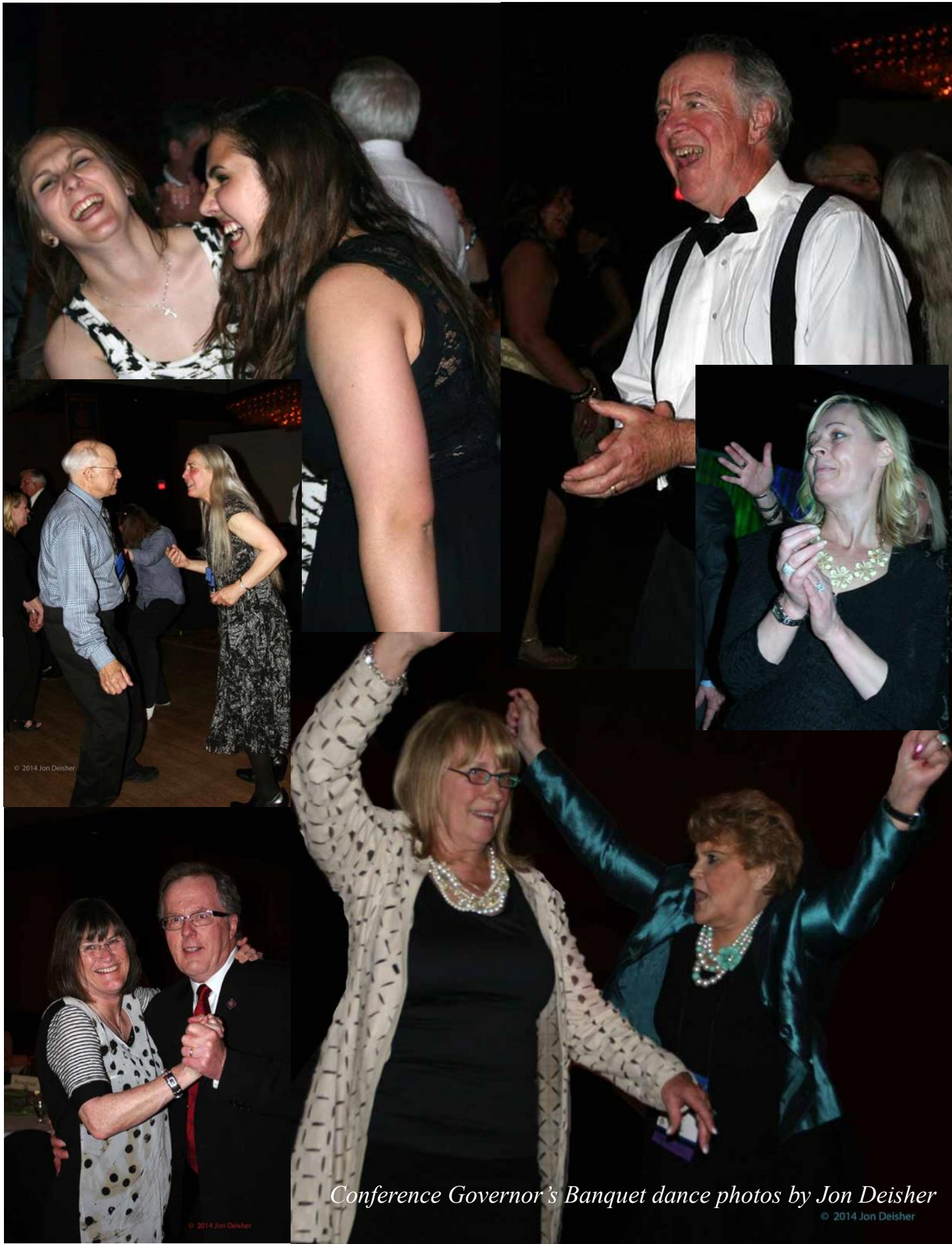
Conference Governor's Banquet dance photos by Jon Deisher