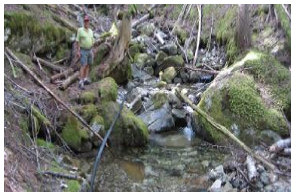
Upper left: Tulip Falls near Castlegar. Right: A natural water slide near the falls. Lower left: Christina Lake