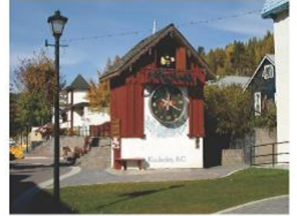
Photos: The mountain city of Kimberley in Rotary District 5080

District 6200—Cajun Country in South Louisiana. Rotarians there say that they “...can’t think of a more different American culture than that of our county’s extreme north and extreme south.” Think Jazz Festival or Mardi Gras or Cajun food! They are interested in a Friendship Exchange in 2015.