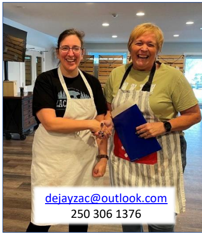
dejayzac@outlook.com 250 306 1376