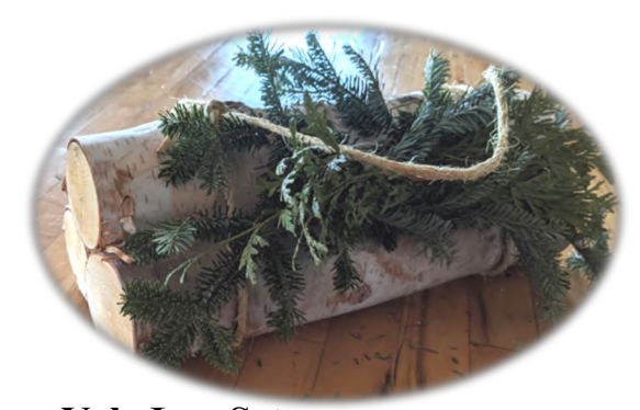
16" Centerpiece A 16" Balsam wreath with center birch candle. CTR $25.00