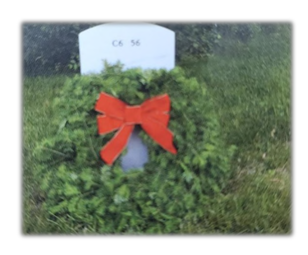
Fallen Hero Wreath Wreath to be delivered to a Wisconsin Veteran Cemetery. HERO $25.00

Wish to learn more or make a donation? Go to: www.pacbsa.org