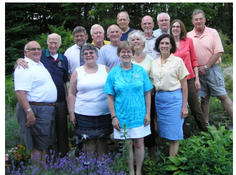
The D-7780 Governor team.