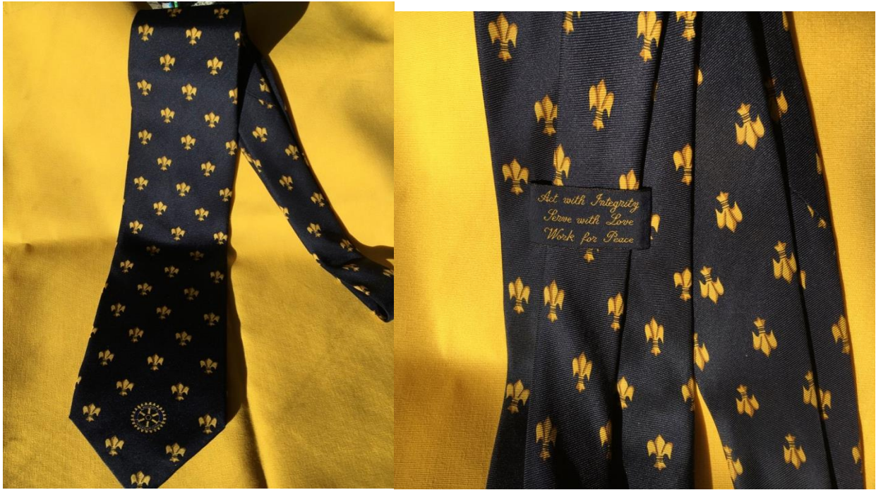
Rotary tie that belonged to Grant Wilkins; Rotary Wheel with Fleur-de-lis background. Inscription reads: "Act with Integrity, Serve with Love, Work for Peace"