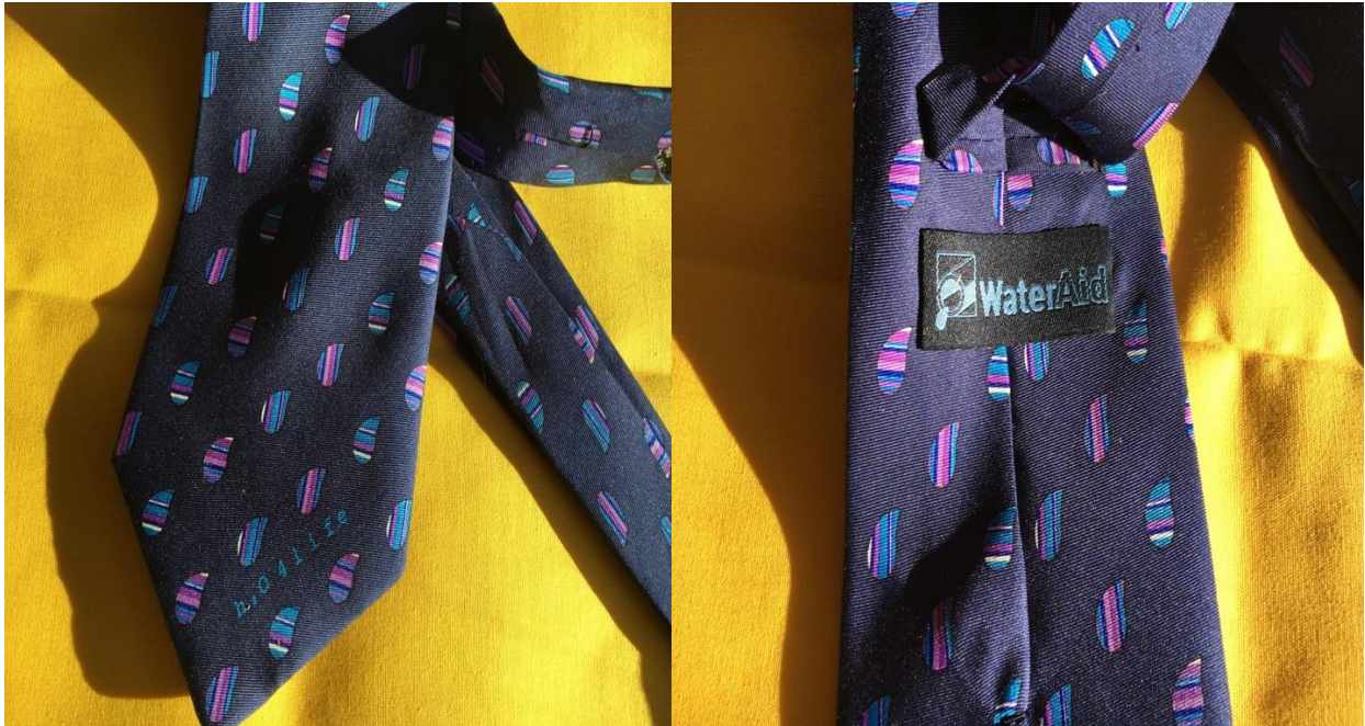
Inscription on front of tie reads, "H2O 4 Life" and tag on inside of tie reads, "WaterAid"