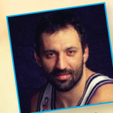
Vlade Divac NBA Hall-of-Famer