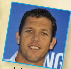
Luke Walton Former NBA Player