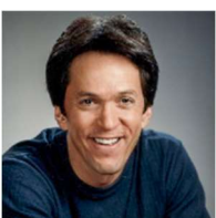
MITCH ALBOM is an internationally renowned and best-selling author, journalist, screenwriter, playwright, radio and television broadcaster and musician. His books have collectively sold more than 40 million copies worldwide. Albom has founded nine charities in the metropolitan Detroit area. In 2010, Albom was named the recipient of the Red Smith Award for lifetime achievement by the

Associated Press Sports Editors. In 2013, he was inducted into the National Sports Media Association’s Hall of Fame, followed by the Michigan Sports Hall of Fame in 2017.