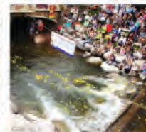
Duck Race 3:00 pm