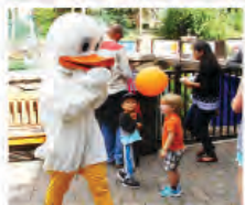
Family Fun For All