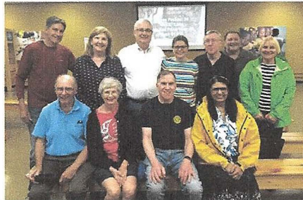
Club members making a difference by helping out at Feed My Starving Children.