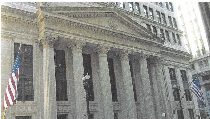
The Federal Reserve Bank of Chicago