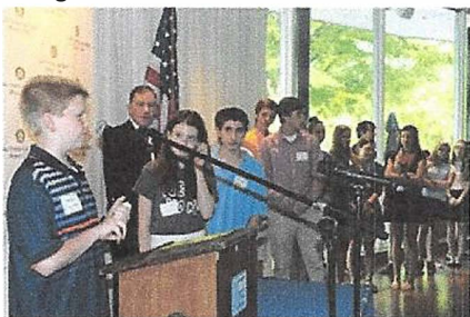
Youth Service Recognition Awards ceremony, an annual event.

We invite you to support the Lake Forest-Lake Bluff Rotary's philanthropic mission. For the past 62 years, the Rotary has given over $1 million to improve the lives of others in our community and our world. You won't want to miss this unique opportunity to promote your business to this dynamic and affluent audience. The Lake Forest-Lake Bluff Rotary Club is part of Rotary International, a worldwide organization of more than 1.2 million business, professional, and community leaders. Members of Rotary Clubs, known as Rotarians, provide humanitarian service, encourage high ethical standards in all vocations, and help build goodwill and peace throughout the world. There are 35,000 Rotary Clubs in more than 200 countries and geographic areas. Clubs are open to all. As signified by the motto Service Above Self, Rotary's main objective is service: in the community, in the workplace, and throughout the world.