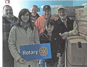
Delivery of winter coats to children in North Chicago and Highwood through Operation Warm - Past 12 years