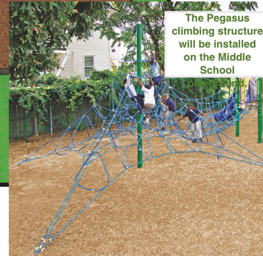
The Pegasus climbing structure will be installed on the Middle School