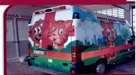
Children's ambulance – Italian Red Cross