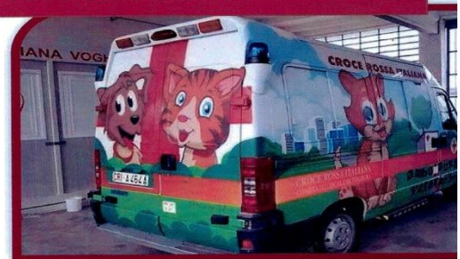
Children's ambulance – Italian Red Cross